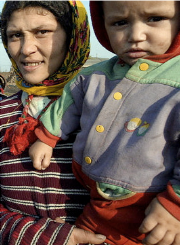
Option 1 - Italy