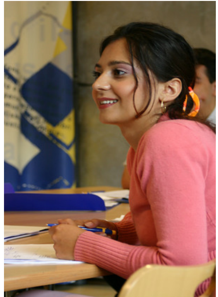
Option 2 - Student